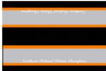
NORTHERN IRISH SERIES CHAMPION