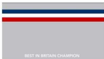
BEST IN BRITAIN CHAMPION