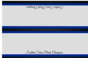
SCOTTISH SERIES CHAMPION