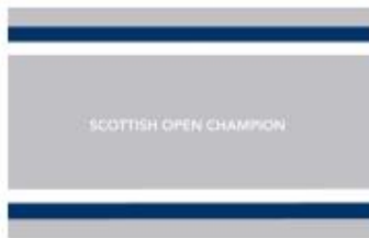
SCOTTISH OPEN CHAMPION.