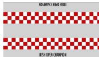
IRISH OPEN CHAMPION.